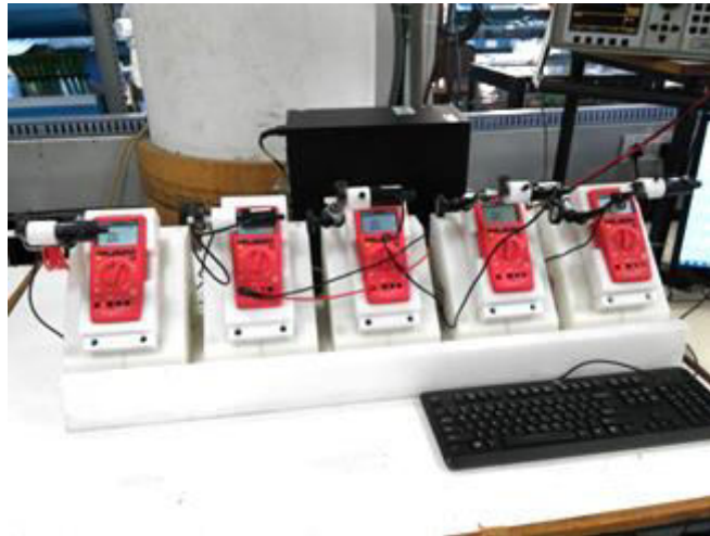
Fig. 3. Image capturing using web cameras

This process is completely automatized and involves zero human intervention, it successfully replaces the use of conventional system where-in the operator manually changes the output of the calibrator and calibrates the instrument. During each test & calibration cycle, an e-test certificate is automatically generated. This generated e-TC gets uploaded on the cloud and is made available to customers purchasing the multimeter, only a specified model no., serial no. of order confirmation is required to login to the system and obtain the test certificate.