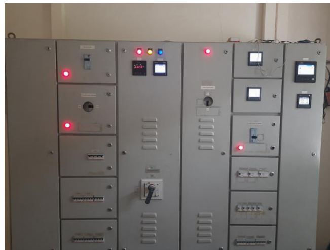
Fig. 5. Energy monitoring devices installed in premises

With the help of various energy monitoring devices at different nodes in an industry, the data regarding energy consumption is transferred over the cloud.