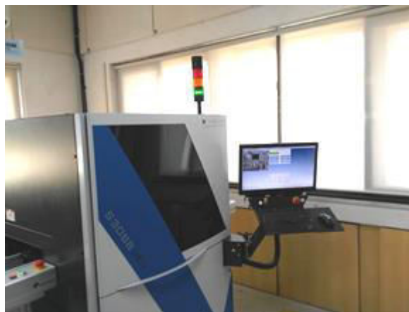
Fig. 2. Automated Optical Inspection System

It eliminates human errors and time required for manual PCB inspection. It also has a provision of providing feedback to the adjacent flow machine connected to it. It provides feedback related to settings of the right temperature in the flow machine so that soldering is done at the right temperature and no overheating takes place. Machine tests average size board of 100mm x 50 mm with high complexity within 15 seconds. Thus saving a large amount of time, generally 10 to 15 min depending on the size of PCB while manually inspecting the defects and correcting them.