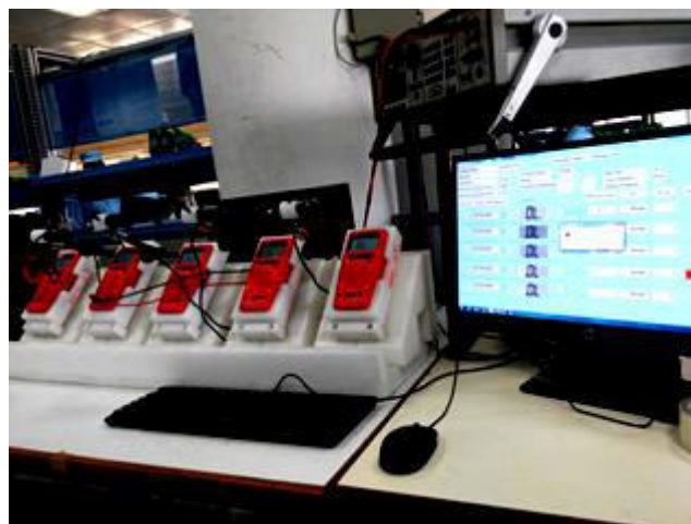
Fig. 4. Closed loop testing and calibration

This not only makes the system error free or free from human-intervention, but also helps reduce carbon footprints by using electronic media to provide test certificates.